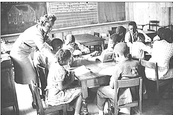
New farm school, Montgomery, Alabama 1939