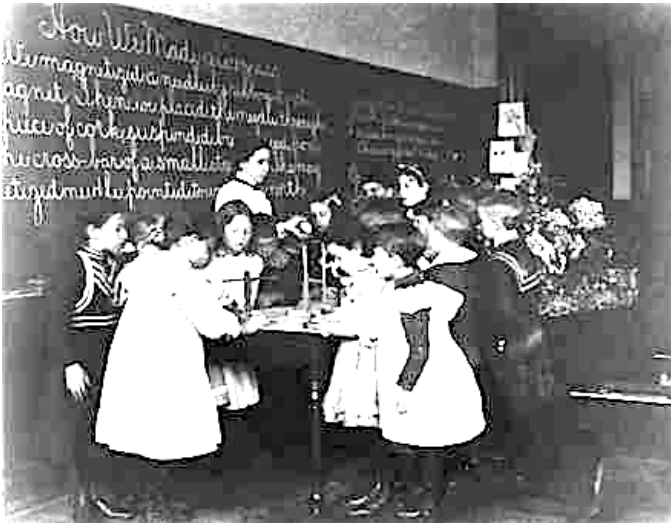
John Dewey's school in Chicago, 1894

These four photographs come from classrooms which may have some characteristics of learning communities. But in what way are such characteristics observable?