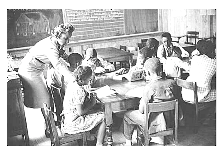
New farm school, Montgomery, Alabama 1939