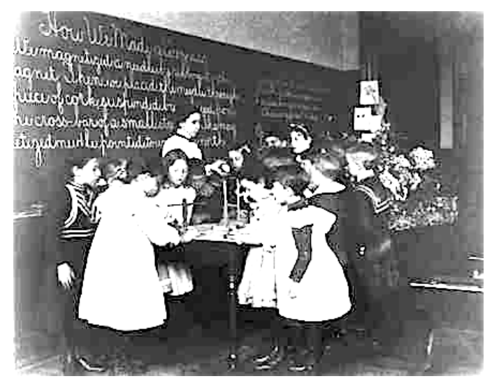
John Dewey's school in Chicago, 1894

These four photographs come from classrooms which may have some characteristics of learning communities. But in what way are such characteristics observable?