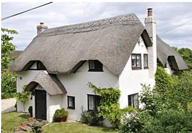
Hannington, Abbotts Thatch, Ibworth Lane