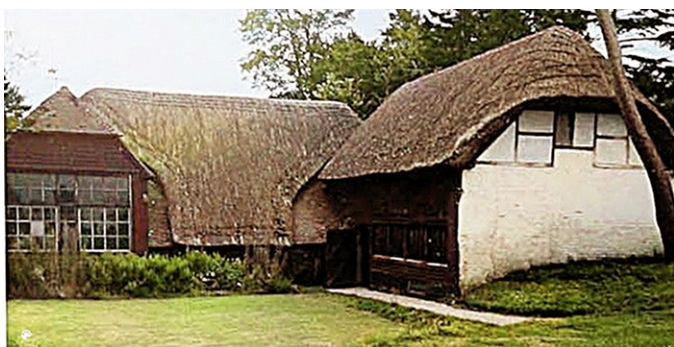
Barn at Stantons Farmhouse, Newbury Road

Which brings farm buildings into attention. So barns at Knowl Hill House and Stantons Farmhouse, Newbury Road come into the picture. But they’re from the 1930s.