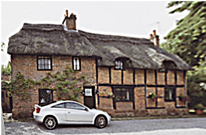
Headley, Dodds Cottage, Newbury Road