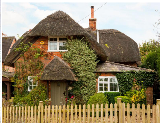
Ashford Hill. Jessamine Cottage, Chapel Lane