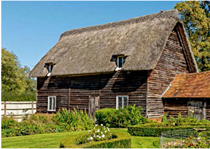
Headley, Holdrop House, barn