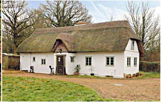
Headley, Windrush, Plastow Green