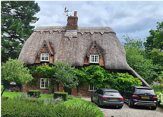
Ecchinswell, Oak Cottage,