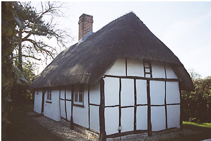
Ashford Hill, The Bungalow