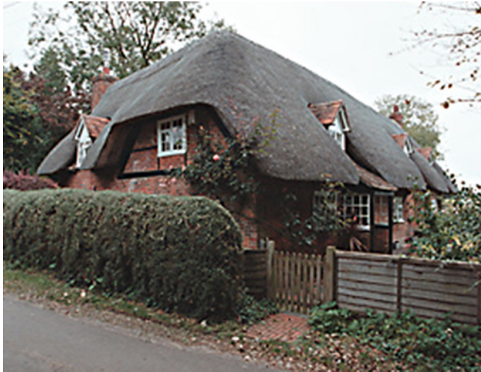
Hannington, Corner Cottage, Ibworth Lane