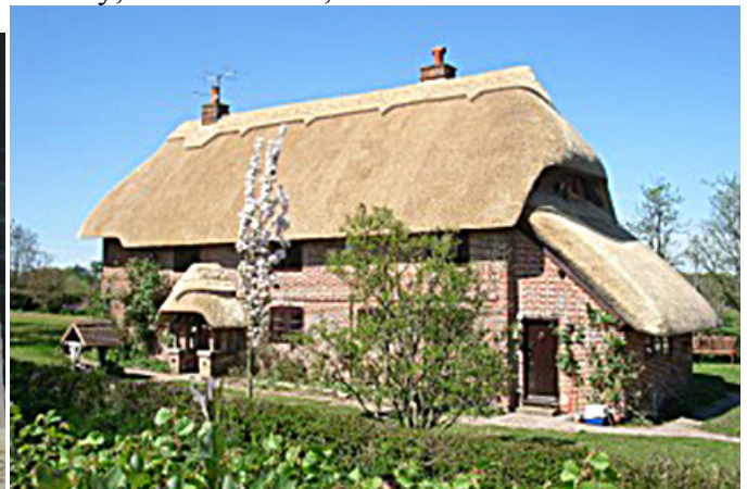
Headley, Spradbray, off Galley Lane