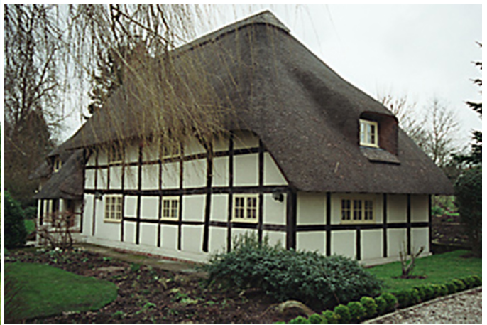
Ashford Hill, White Cottages, Plastow