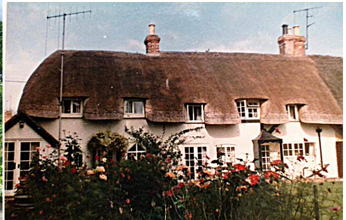
Ecchinswell, Riverside Cottages,