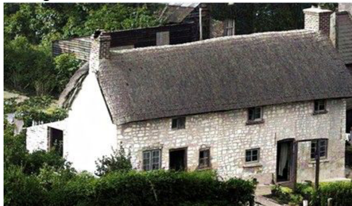
Chalk Cottages The Dell demolished in the 1950s