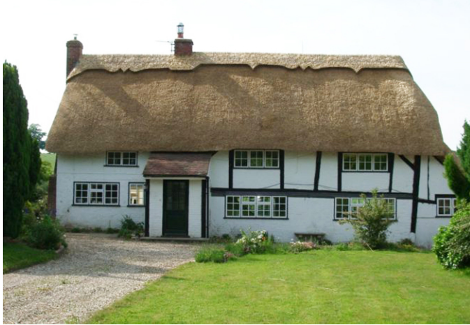
Ashford Hill, Wellmeadow Cottage, Plastow