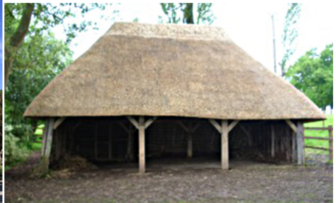
Ashford Hill, cartshed at Pit House Farm