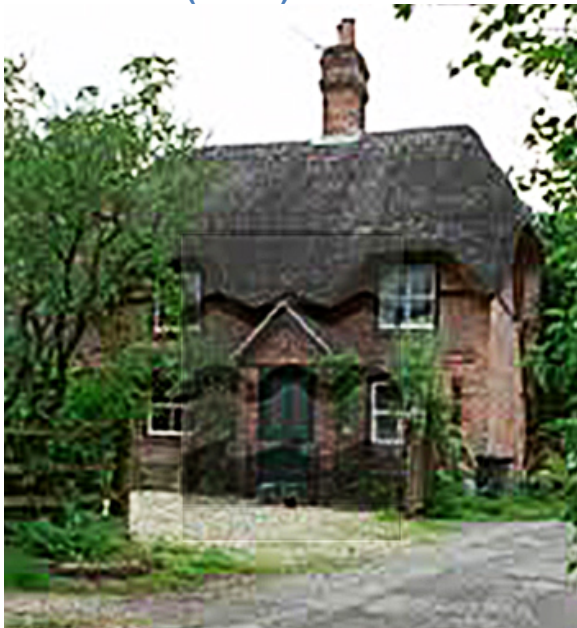
Ecchinswell, Burnside, Mill Lane,