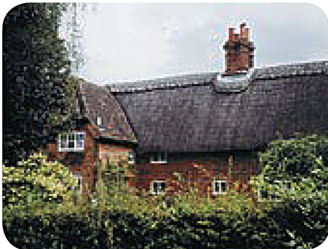
Ecchinswell, Church Villa