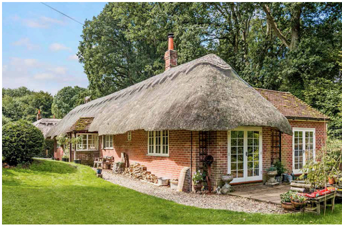
Ecchinswell, Elephant Cottage, Brocks Green,