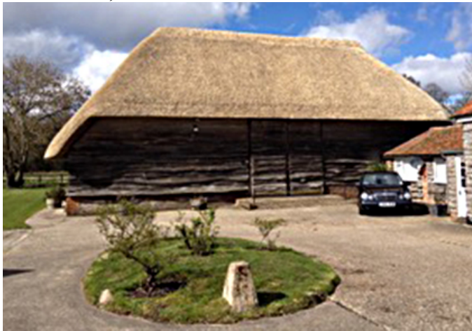
Ecchinswell, Malt House farm barn