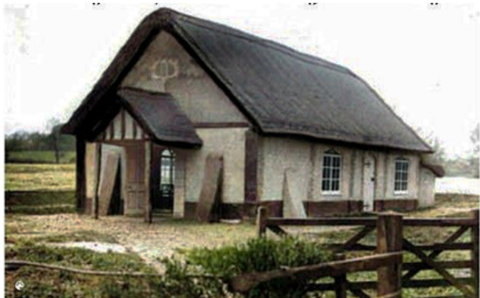
Wolverton Village Hall 1921