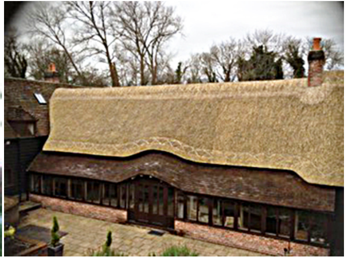
Ecchinswell, Chapel Farm barn