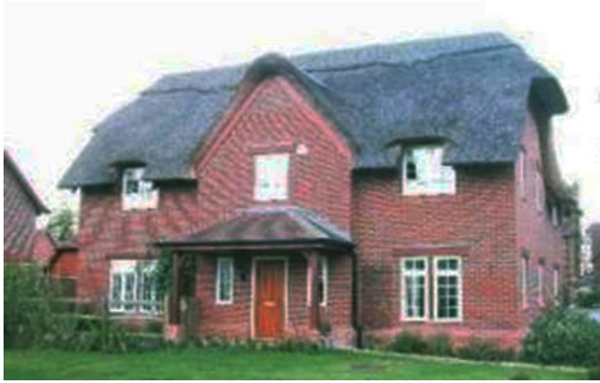
Ecchinswell, 1 Palmers Yard