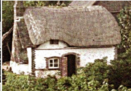
Here it is in the 1930s