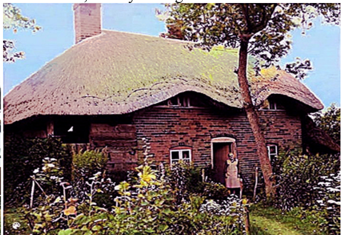
Ashford Hill. Riverside Cottage 1930s