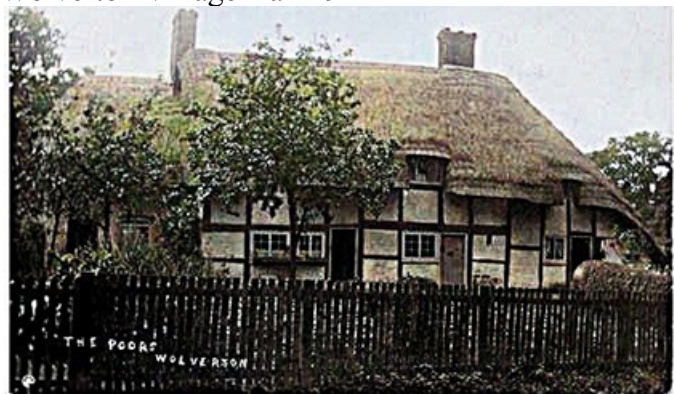
Wolverton The Poors c.1910, now Cricket Cottage