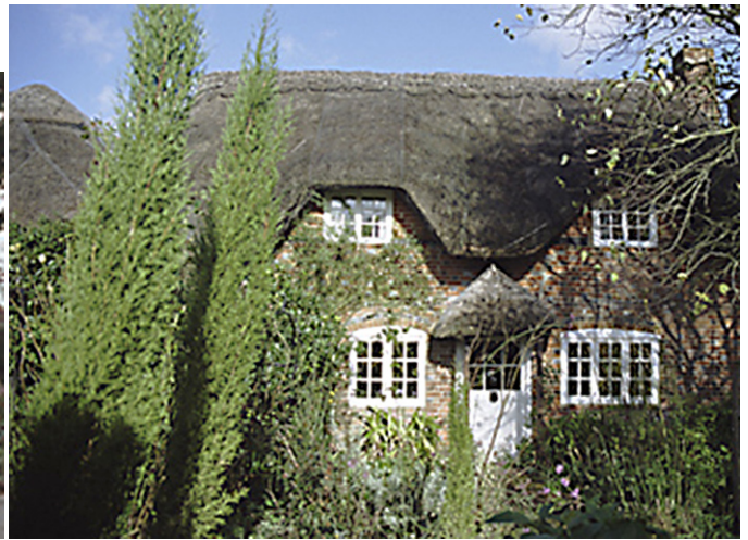
Hannington, Dickers Farm Cottage