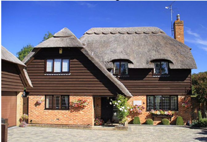
Ashford Hill, Whychwood Cottage, Old Lane