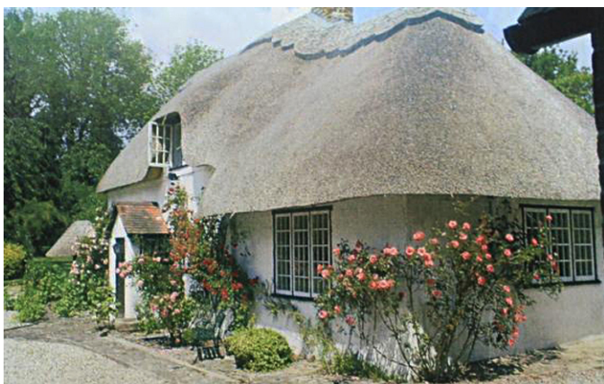
Headley, Rivendell Cottage, 2 Plastow Green