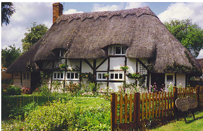
Ecchinswell, Woodley Cottage