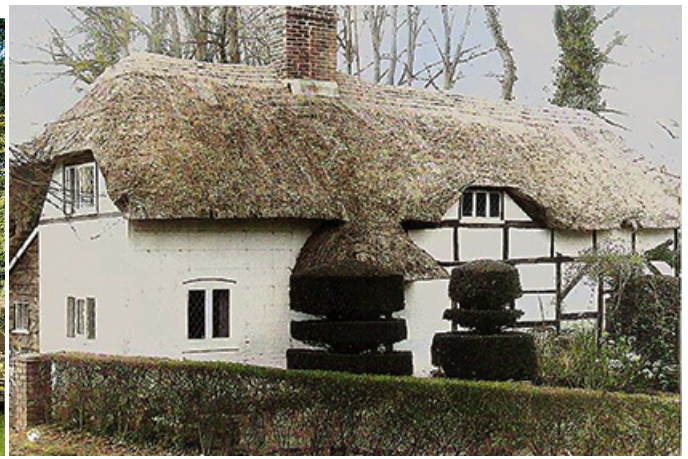
Ecchinswell, Kisby's Cottage