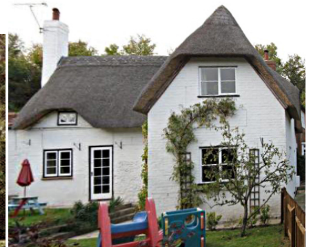
and now (with extension)