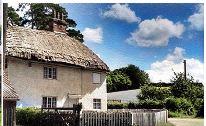
Ecchinswell, Chapel Cottages