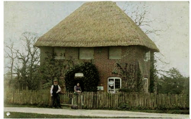
Wolverton Post Office 1900