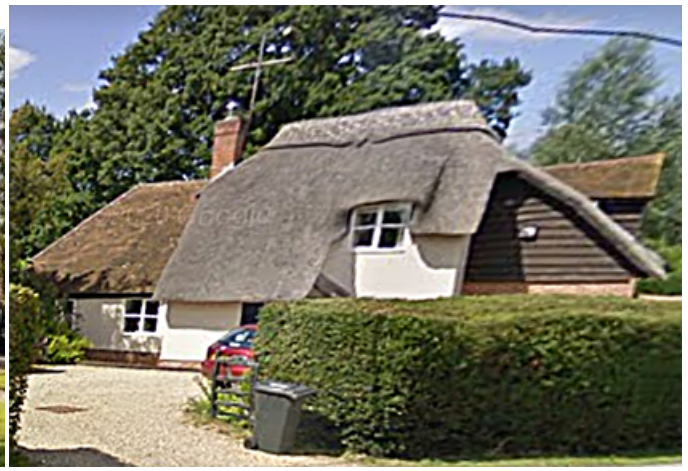
Ashford Hill, Cary Cottage