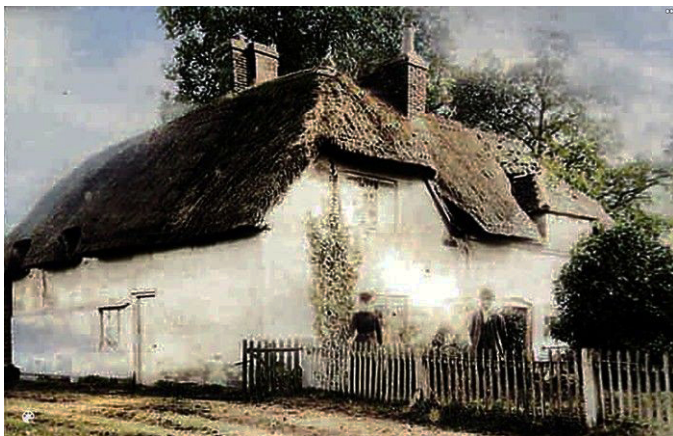
Ecchinswell, Swaites Farm 1905,