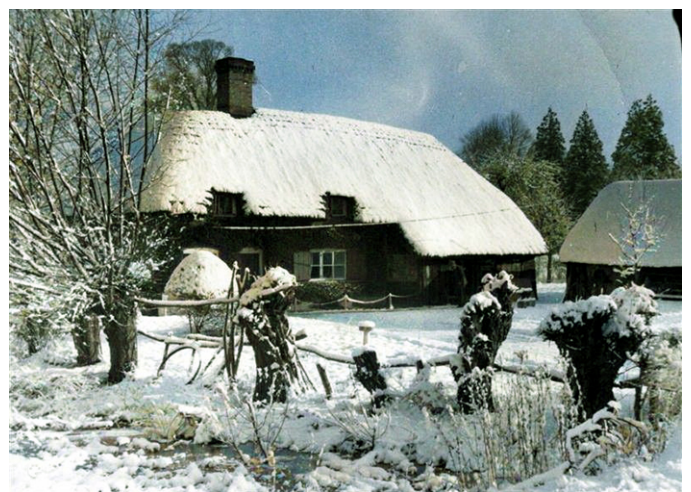
Ecchinswell, Corner House Farm 1906,