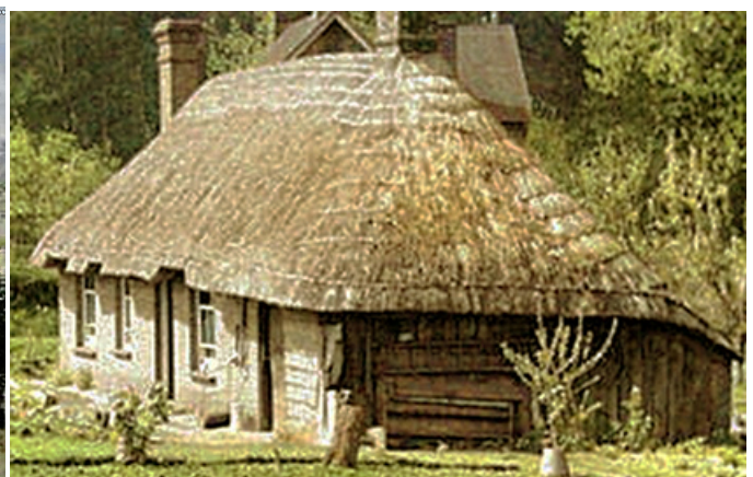
Ecchinswell, Thatch Cottage - Brocks Green