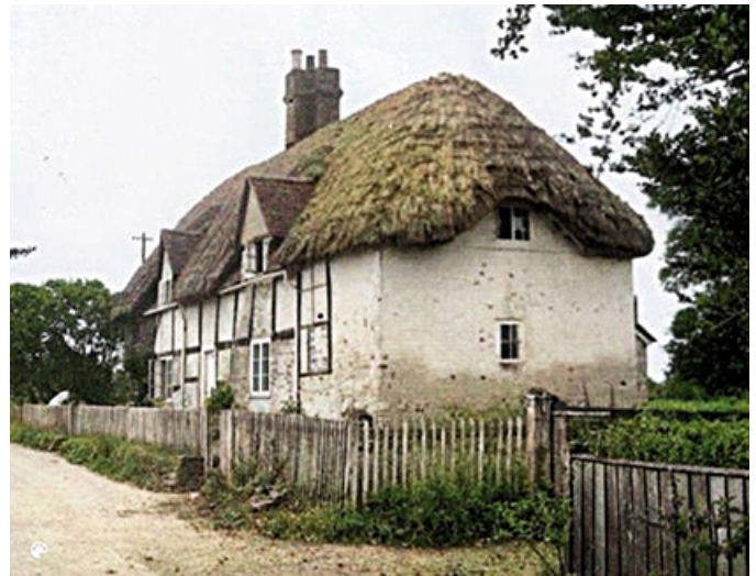
Ecchinswell, Chesnut Cottages