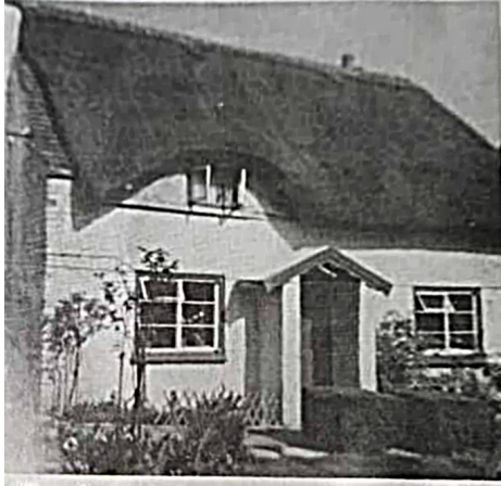
It's 13 the Dell Leven Cottage

Kingsclere is not characterised by thatched buildings (it is said that there are 100,000 in UK) So you might have seen this description: