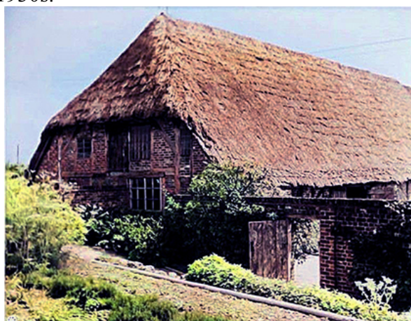
Knowl Hill House barn 1930s