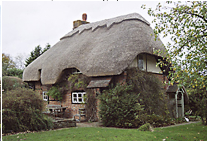
Ashford Hill, Cherry Cottage