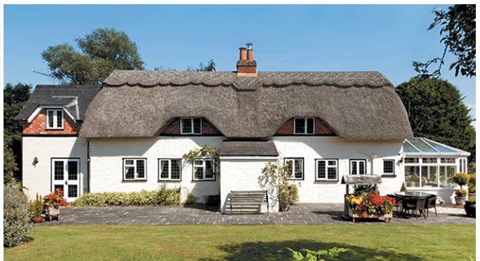
Wolverton The Thatched Cottage