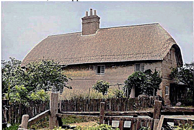
Ashford Hill Farmhouse 1930s