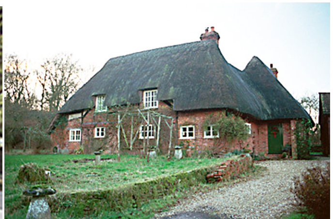
Headley, Staddlestones, Common Road