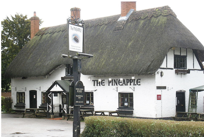
Ashford Hill, Pineapple Inn