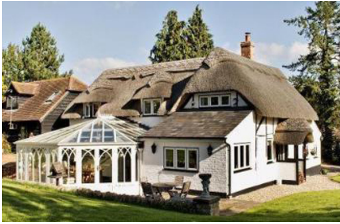
Ashford Hill, Meadow Cottage, Old Lane,