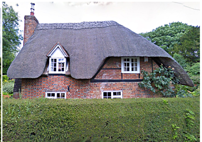
Hannington, Pixie Cottage, Ibworth Lane