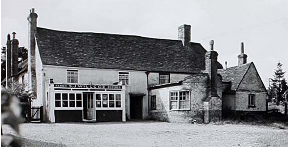
Photo from 1930s when it had been converted to Willcox butchers