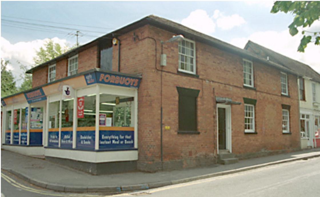
3 Swan Street

C17, early C19. A short 2-storeyed terrace, being a refronting of a timber-frame; 5 regular upper windows to the front. Tile roof, hipped at the south end, the front hip being higher than the return south slope; wrought-iron eaves brackets. Painted brick walling in Flemish bond, 2 rubbed flat arches, stone cills. Sashes in reveals, one modern ground-floor casement: the south side has a double shop-front, with bow windows (with modern interior framing), a moulded cornice, thin fluted pilasters, a fanlight above the doorway with diagonal glazing bars. Modern doors, No 1a within a solid frame enclosing a fanlight and below a plain canopy. The north end gable has exposed framing, showing the front wall as an addition with a higher eaves level. The rear elevation has a lower eaves, 3 unequal gables, 2 being tile-hung.