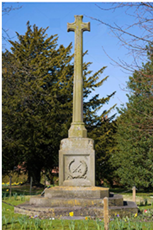
Swan Street, Church of St Mary WW1 Memorial Cross

C12, C13, C15, with a substantial new construction and restoration by Hellyer and Ryde of 1843. On the site of a Saxon minister, a large cruciform Norman church, with a central tower, and a later south chapel. The restoration of 1848 accounts for the re-faced exterior, the raising of the tower, and walling of knapped flint with stone dressings; the details are 'Norman', with earlier fragments incorporated in the north door (now filled). The west door has recessed stages with moulded arches on columns, the south chapel has Perpendicular windows and stepped buttresses, the east window having 'Geometrical' tracery. The inside is severaly plain, with deeply-splayed 'Norman' lights to the nave, and an Early English arcade between the chancel and south chapel, having moulded caps. The chapel contains brasses of 1503, 1519 and 1580, as well as a number of C18 and early C19 wall monuments. The south transept has a donations board of 1830, and the tomb monument to Sir Henry Kingsmill (died 1620), and his wife Bridget (died 1672). Unique weather vane.