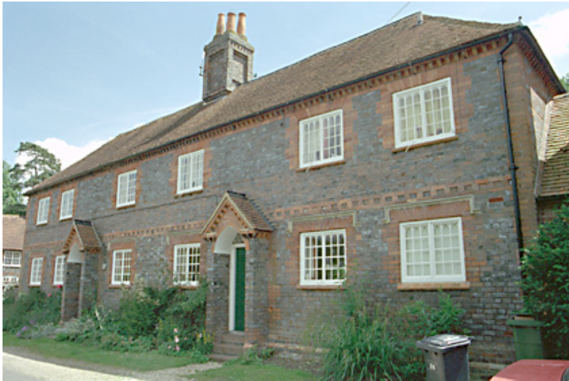
26 and 28 North Street

Mid C19. A wide symmetrical pair with a front of 2 storeys, 6 windows. Hipped tile roof, carved brick dentil eaves; central stack of blue brickwork, with panels. Walling of blue brickwork in Flemish bond, with red dressings; eaves fascia, first-floor band (with blue header decoration), plinth; stone hood-moulds to the ground-floor. Shallow porches have pointed arches on brick pilasters, and boarded doors in solid frames.