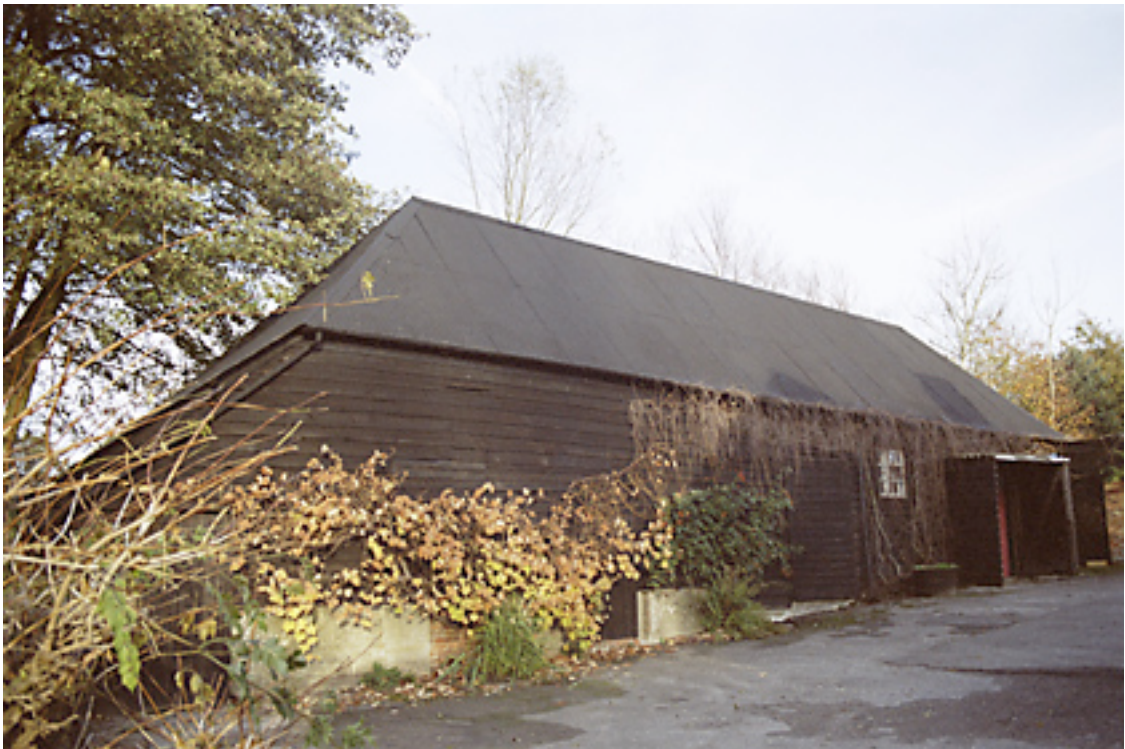
Barn at Nutkins Farmhouse, Union Lane C18. Four-bay timber-frame with aisles on one long and one short side. Queen post truss. Corrugated-iron roof. Boarded walls.