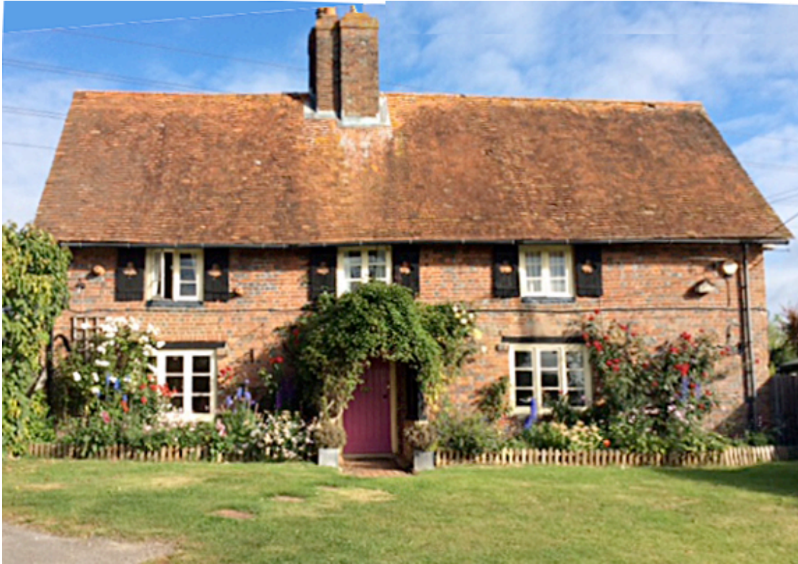
Hall's Farmhouse, Union Lane

C17, C18 and early C19. Timber-framed house, refronted at the last date. Tile roof, slate above rear outshots, large central shafted stack. The rear wall has exposed framing (bricknogged), the west gable is mainly tile-hung, the front is of red brickwork in a mixed bond. Casements. Tudor-arched plain doorway with a boarded door. The east end has timber-framing in the gable, above a C18 brick wall, with cambered openings.