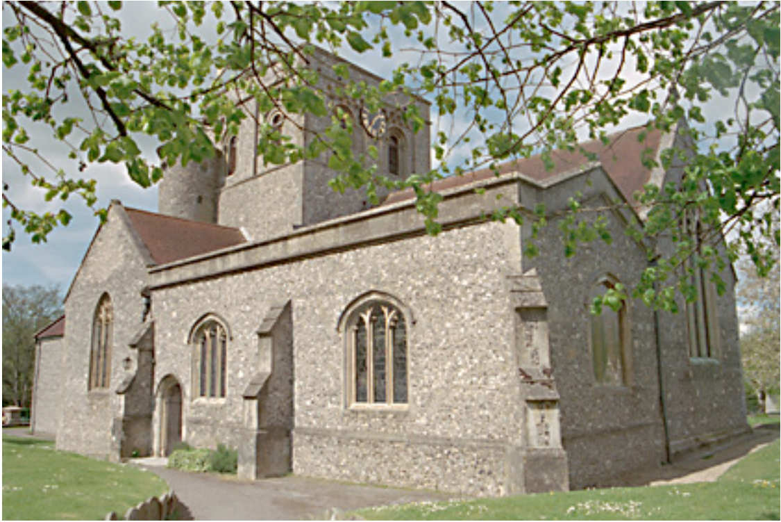
Swan Street, Church of St Mary

C12, C13, C15, with a substantial new construction and restoration by Hellyer and Ryde of 1843. On the site of a Saxon minister, a large cruciform Norman church, with a central tower, and a later south chapel. The restoration of 1848 accounts for the re-faced exterior, the raising of the tower, and walling of knapped flint with stone dressings; the details are 'Norman', with earlier fragments incorporated in the north door (now filled). The west door has recessed stages with moulded arches on columns, the south chapel has Perpendicular windows and stepped buttresses, the east window having 'Geometrical' tracery. The inside is severaly plain, with deeply-splayed 'Norman' lights to the nave, and an Early English arcade between the chancel and south chapel, having moulded caps. The chapel contains brasses of 1503, 1519 and 1580, as well as a number of C18 and early C19 wall monuments. The south transept has a donations board of 1830, and the tomb monument to Sir Henry Kingsmill (died 1620), and his wife Bridget (died 1672). Unique weather vane.