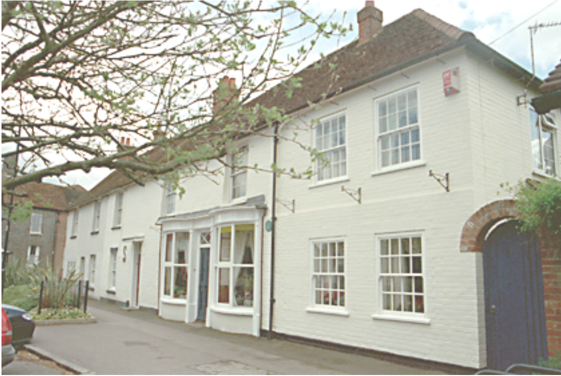
1, 1a and 1b Swan Street

C17, early C19. A short 2-storeyed terrace, being a refronting of a timber-frame; 5 regular upper windows to the front. Tile roof, hipped at the south end, the front hip being higher than the return south slope; wrought-iron eaves brackets. Painted brick walling in Flemish bond, 2 rubbed flat arches, stone cills. Sashes in reveals, one modern ground-floor casement: the south side has a double shop-front, with bow windows (with modern interior framing), a moulded cornice, thin fluted pilasters, a fanlight above the doorway with diagonal glazing bars. Modern doors, No 1a within a solid frame enclosing a fanlight and below a plain canopy. The north end gable has exposed framing, showing the front wall as an addition with a higher eaves level. The rear elevation has a lower eaves, 3 unequal gables, 2 being tile-hung.