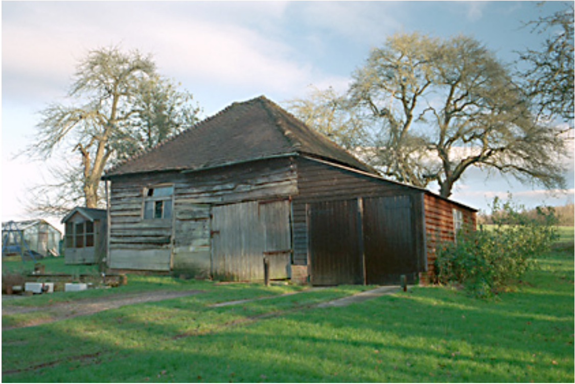
Small barn or granary at Harriden Farmhouse, Union Lane C18. Two-bay timber-frame, now on a brick base. Half-hipped tile roof. Boarded walls.