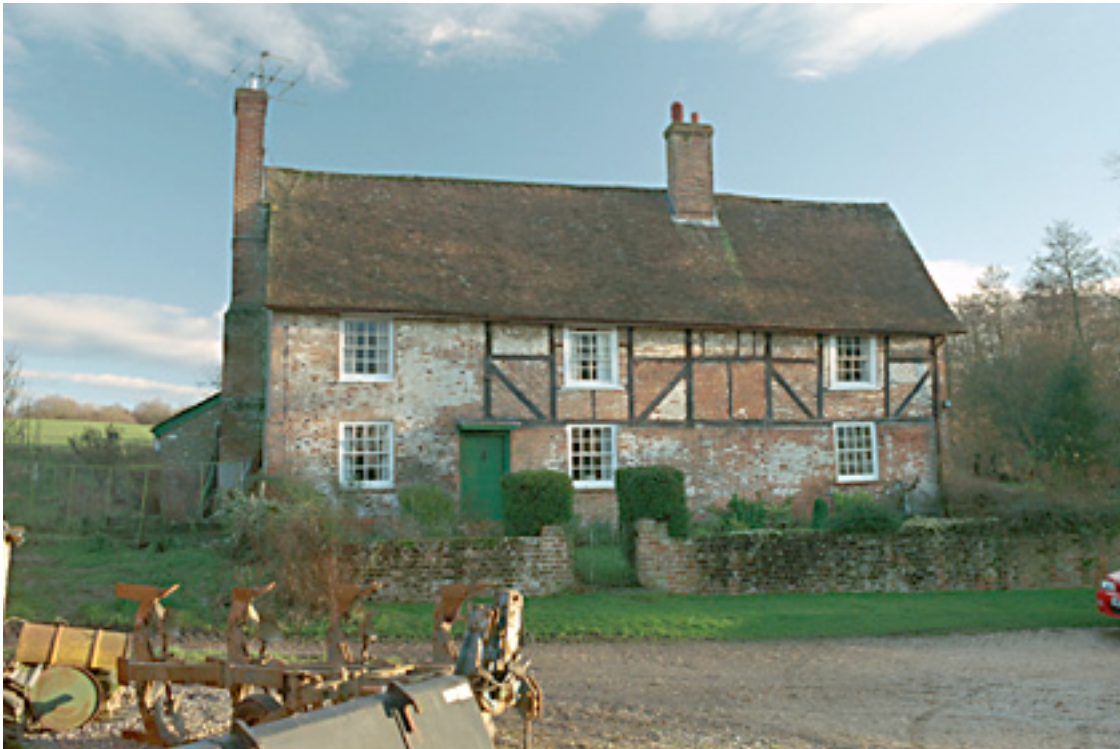
Harriden Farmhouse, Union Lane

C17, C18 and early C19. Timber-framed house, refronted at the last date. Tile roof, slate above rear outshots, large central shafted stack. The rear wall has exposed framing (bricknogged), the west gable is mainly tile-hung, the front is of red brickwork in a mixed bond. Casements. Tudor-arched plain doorway with a boarded door. The east end has timber-framing in the gable, above a C18 brick wall, with cambered openings.