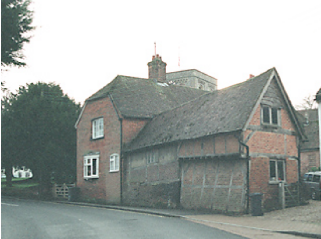
1 Newbury Road, Falcon Inn and barn

C16, C17, mid C19. Formerly the Falcon Inn; a timber-framed house with lower wings to the rear at each end, with recladding of the main block at the last period. Two storeys, regular east elevation of 4 windows. Tile roof, hipped at the south and south-west, half-hipped at the north, gabled north wing, catslide at the rear. Red brick walling in Flemish bond; the north wing (prominent alongside Newbury Road) has bricknogged timber-framing, with a jetty to the end part (barn or malthouse), roughcast on the south side. Victorian 3-light sashes to the east front, otherwise casements. Glazed front door.