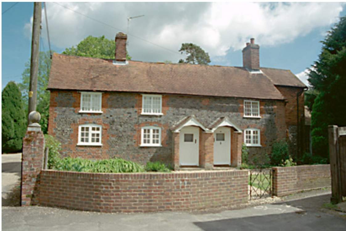
30 and 32 North Street

Mid C19. A wide symmetrical pair with a front of 2 storeys, 6 windows. Hipped tile roof, carved brick dentil eaves; central stack of blue brickwork, with panels. Walling of blue brickwork in Flemish bond, with red dressings; eaves fascia, first-floor band (with blue header decoration), plinth; stone hood-moulds to the ground-floor. Shallow porches have pointed arches on brick pilasters, and boarded doors in solid frames.