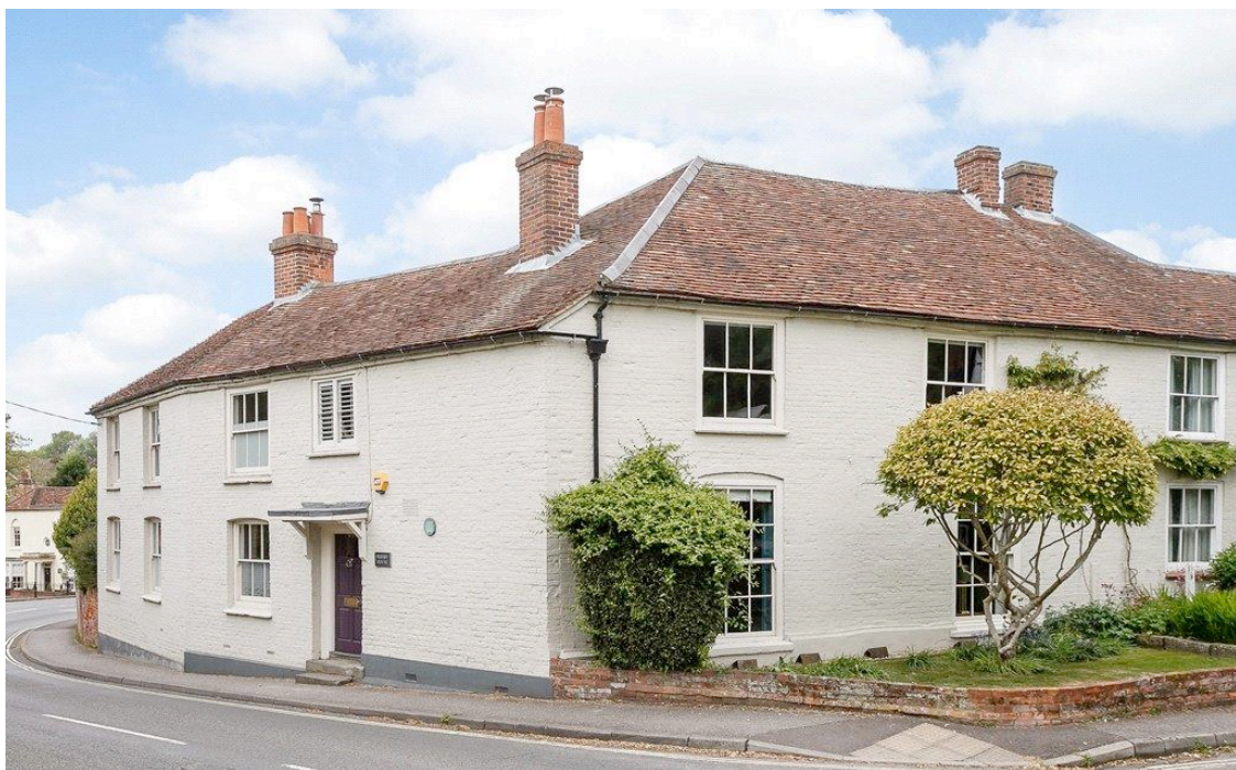
2 Newbury Road, Priory House (and Priory Cottage)

C16, C17, mid C19. Formerly the Falcon Inn; a timber-framed house with lower wings to the rear at each end, with recladding of the main block at the last period. Two storeys, regular east elevation of 4 windows. Tile roof, hipped at the south and south-west, half-hipped at the north, gabled north wing, catslide at the rear. Red brick walling in Flemish bond; the north wing (prominent alongside Newbury Road) has bricknogged timber-framing, with a jetty to the end part (barn or malthouse), roughcast on the south side. Victorian 3-light sashes to the east front, otherwise casements. Glazed front door.