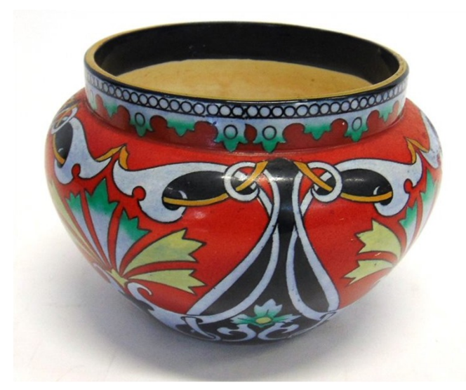
Recently pattern 7891 popped up

It's the 6 inch flowerpot, has an Intarsio backstamp, and as the picture of the base shows, it uses the later method of numbering, incorporating both a shape number (60) and a pattern number (7891).