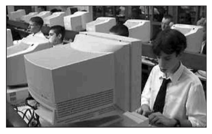
Figure 4: The common view of personalisation and ICT?

Much ICT software brought into classrooms embodies a narrow conception of learning. "Teaching machines" of the 1960s claimed to offer a personalised route, but the offer was limited to some choices through a prescribed programme of pathways. This conception maintains today.