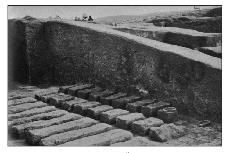
Figure 3: Earliest known classroom 10

A focus on changing the script of the classroom presents a considerable challenge. The classroom is noted for its constancy in the face of change. The basic form of classrooms is remarkably similar across the world, and has changed little since the earliest times. Figure 3 shows the earliest known classroom, excavated in 1934.