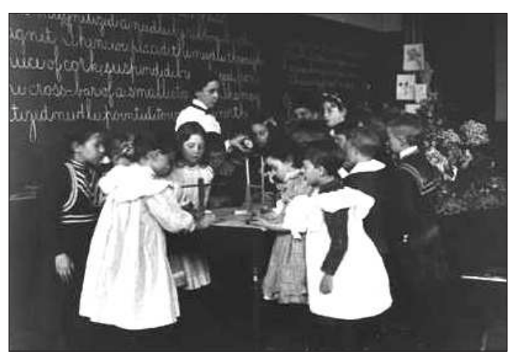
Figure 6: A community classroom - from 1894

As in earlier versions, there are implications for the role of the teacher, and how teachers are seen: