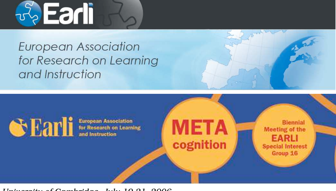
University of Cambridge, July 19-21, 2006